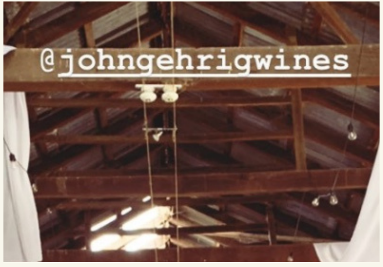
LOCATED IN 2 GREAT LOCATIONS KING VALLEY & RUTHERGLEN